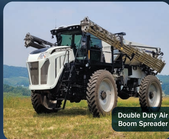
Double Duty Air Boom Spreader