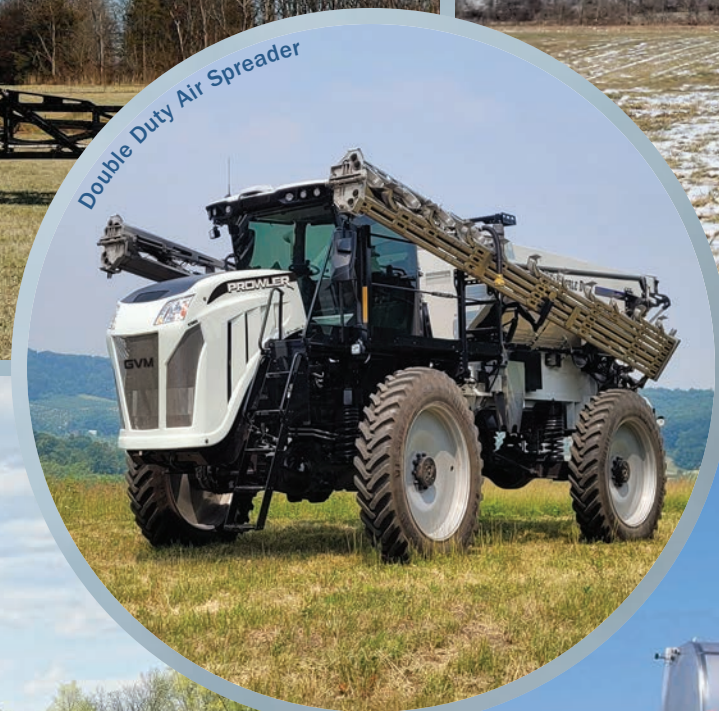
Double Duty Air Spreader