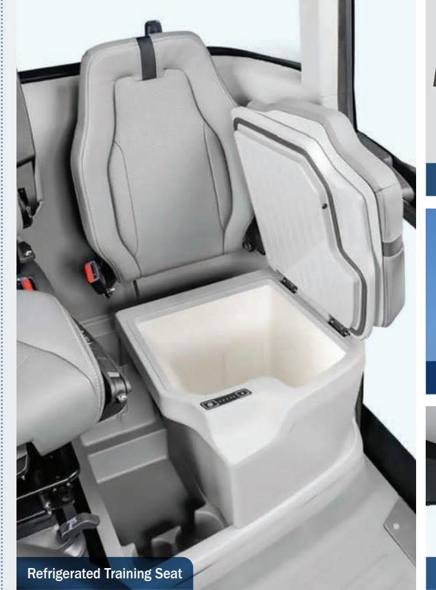
Refrigerated Training Seat