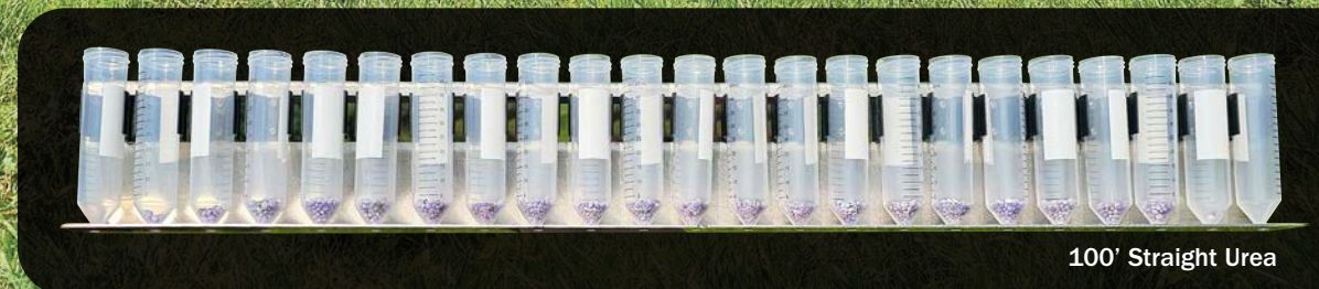
100' Straight Urea