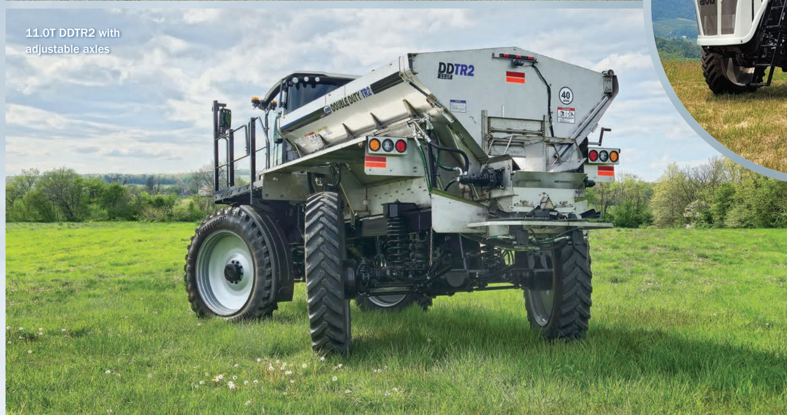
11.0T DDTR2 with adjustable axles