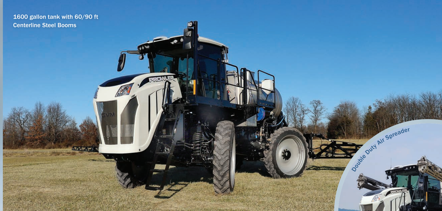
1600 gallon tank with 60/90 ft Centerline Steel Booms