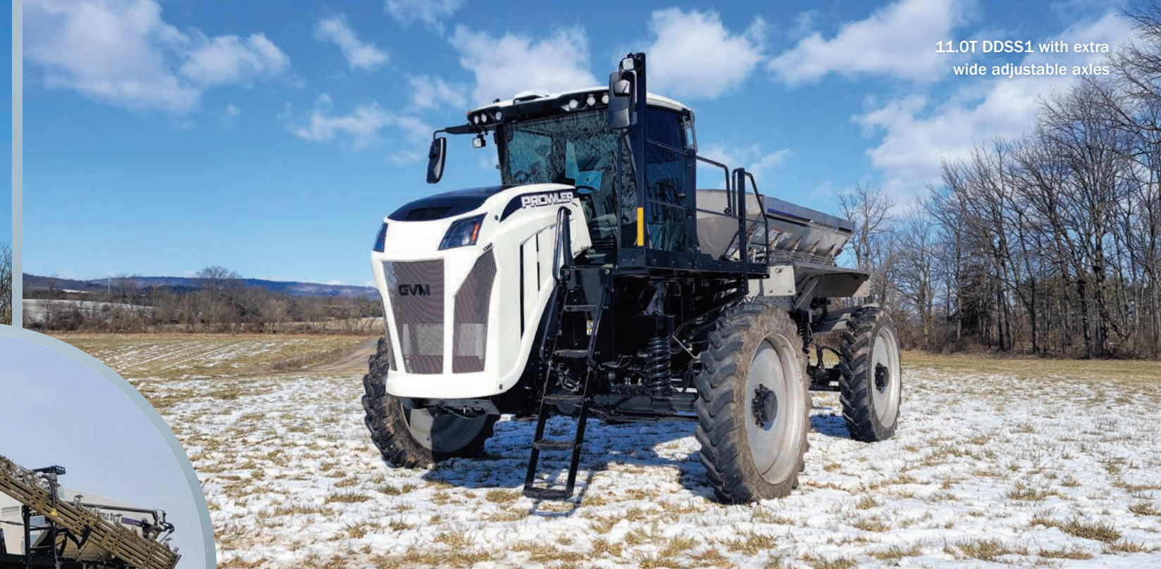
11.0T DDSS1 with extra wide adjustable axles