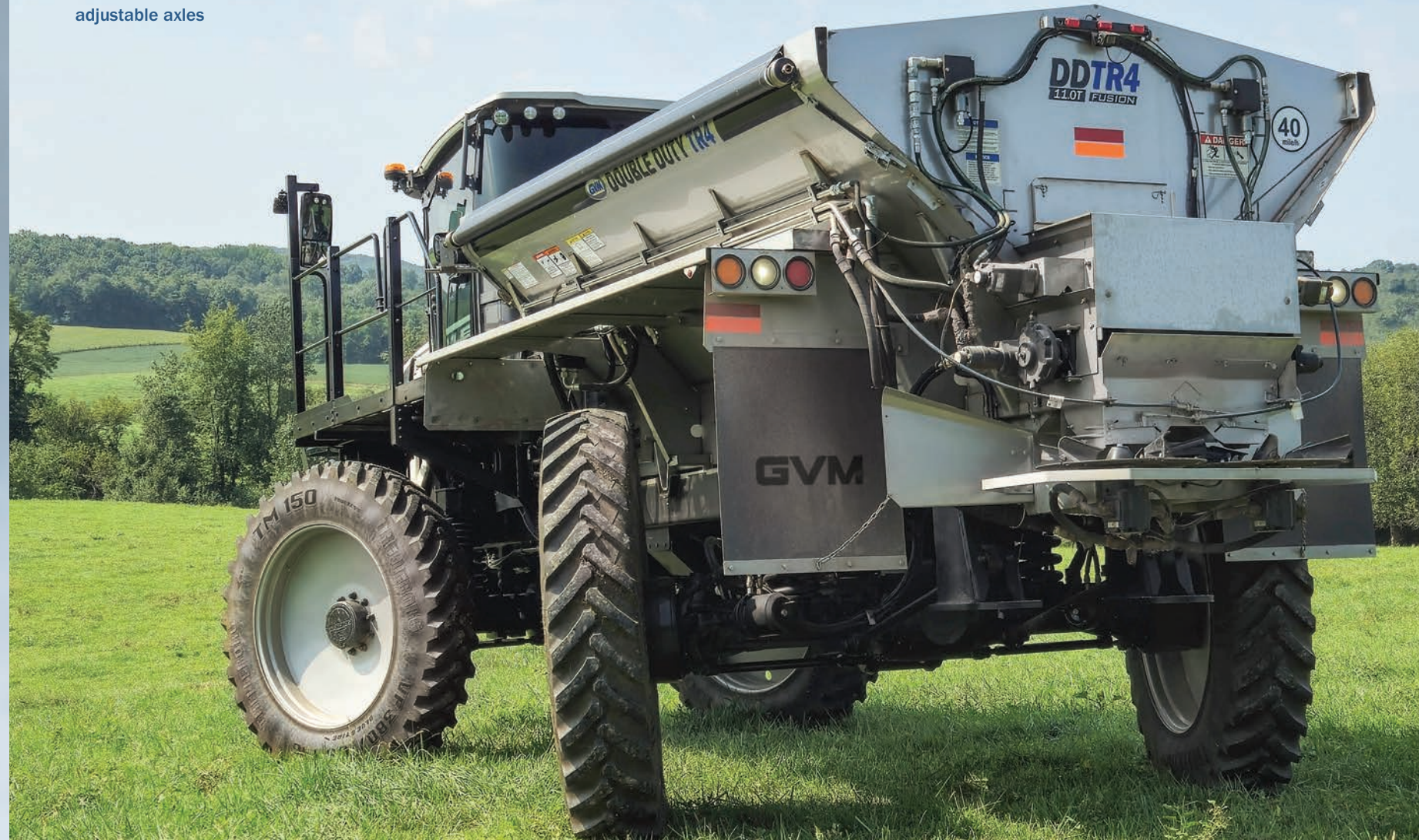
11.0T DDTR4 with adjustable axles