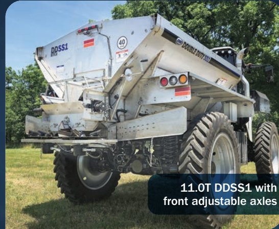
11.0T DDSS1 with front adjustable axles