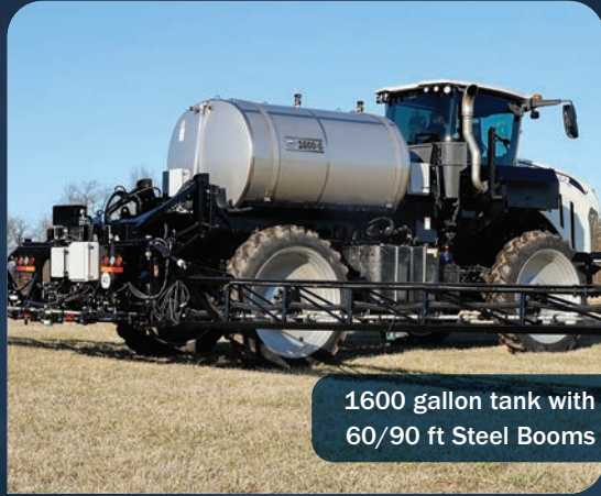
1600 gallon tank with 60/90 ft Steel Booms