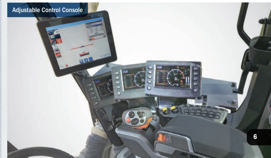
Adjustable Control Console